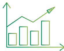
Reporting & Analytics