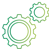
Easy Cloud Management